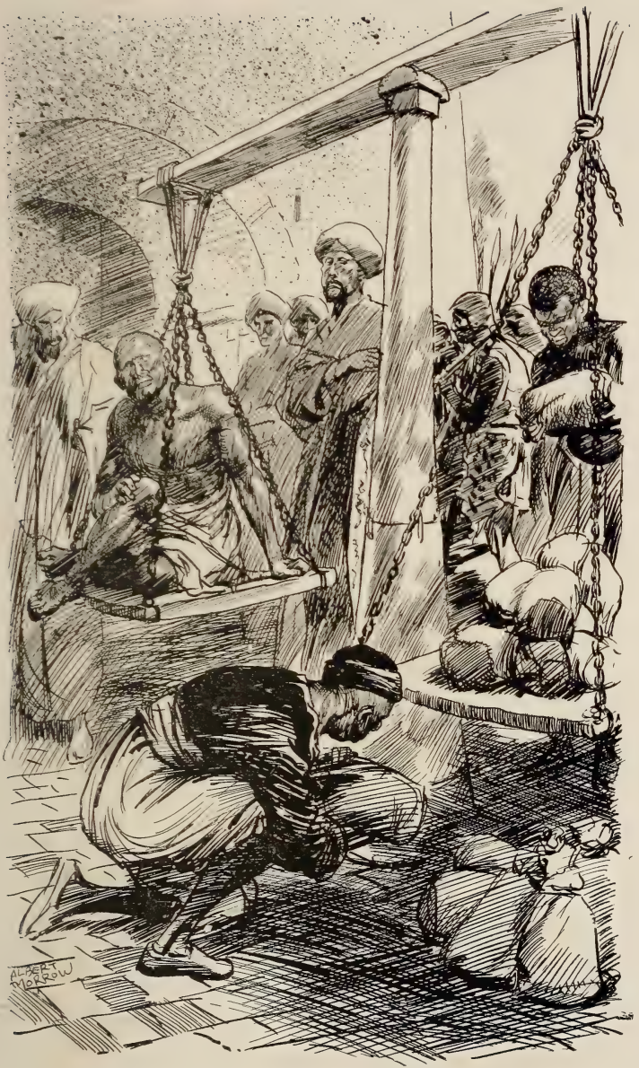
“ They set a number of these bags on one of the scales and ordered Bes to seat himself in the other ” (see page 97).